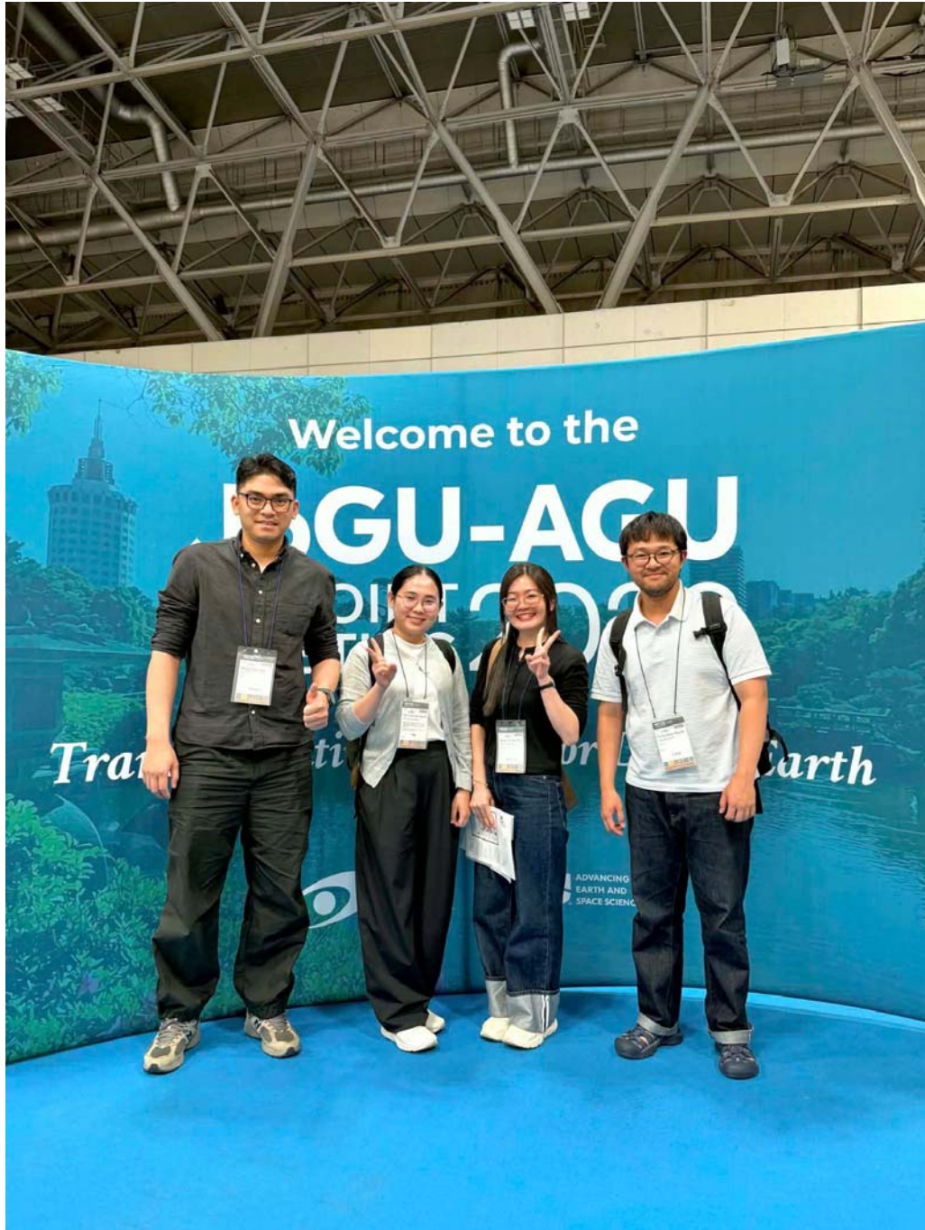
Figure 2 Making the connection with people who work on the same topic as me