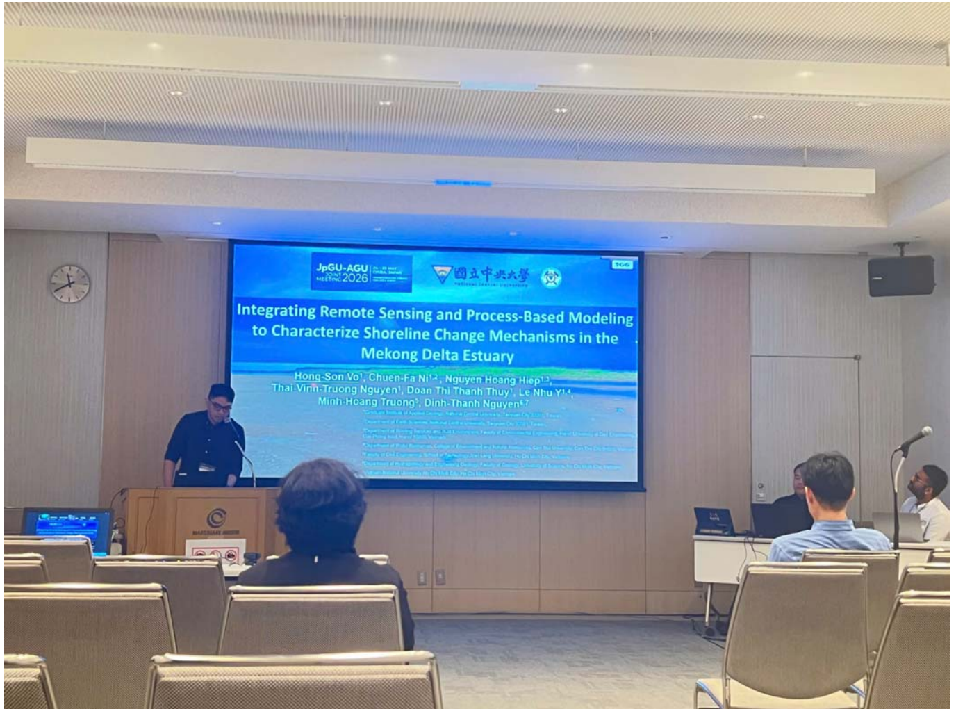
Figure 1 My presentation at the JpGU conference